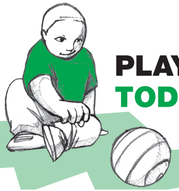
Illustration by Billy Nuñez, age 16